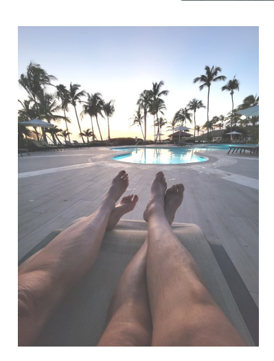
MARC'S VERSION OF "WALDO"