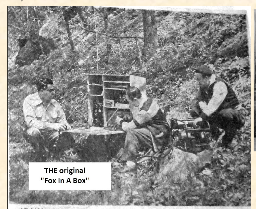
AT hidden location, in five minutes Station WISBF/1 is set up, generator started and operators rib hunters but give no clues as to their location,