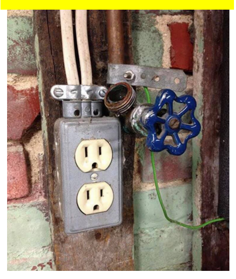
WELL JUST THINK ABOUT THIS.....