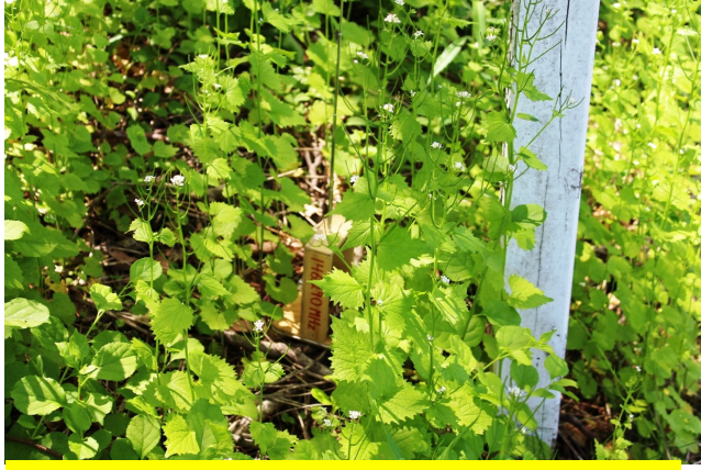
HOPEFULLY THAT WAS NOT POISON IVY!!!