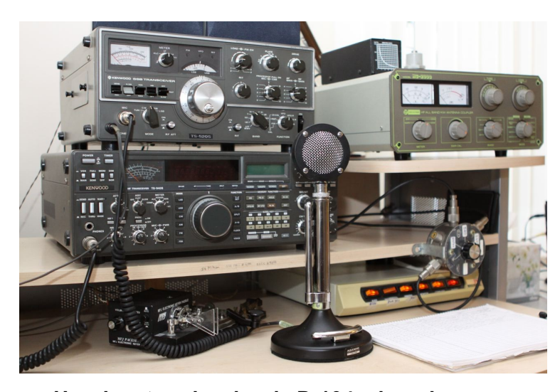
How I restored a classic D-104 microphone