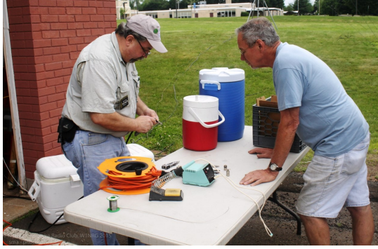
K1LYP JUST GETTING TALLER