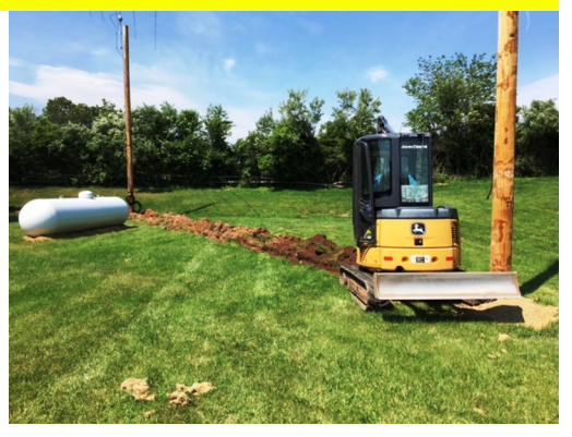
FIELD DAY STREAM???