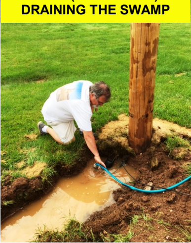
K1DT (DON TRUMP)